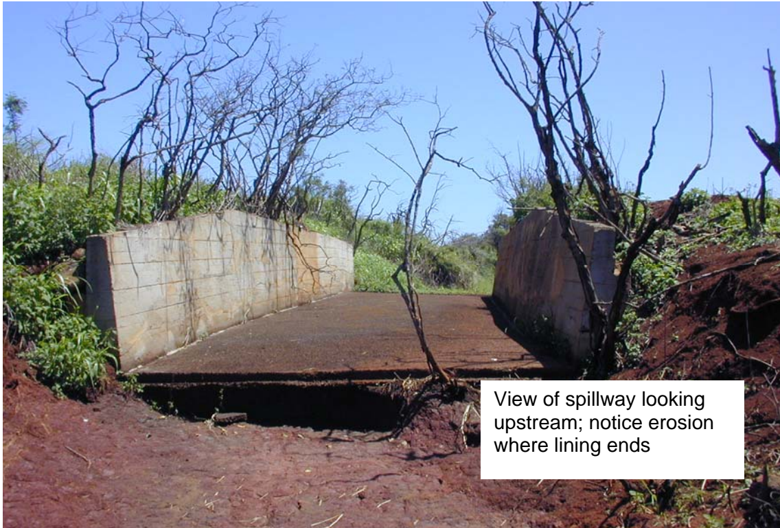
View of spillway looking upstream; notice erosion where lining ends