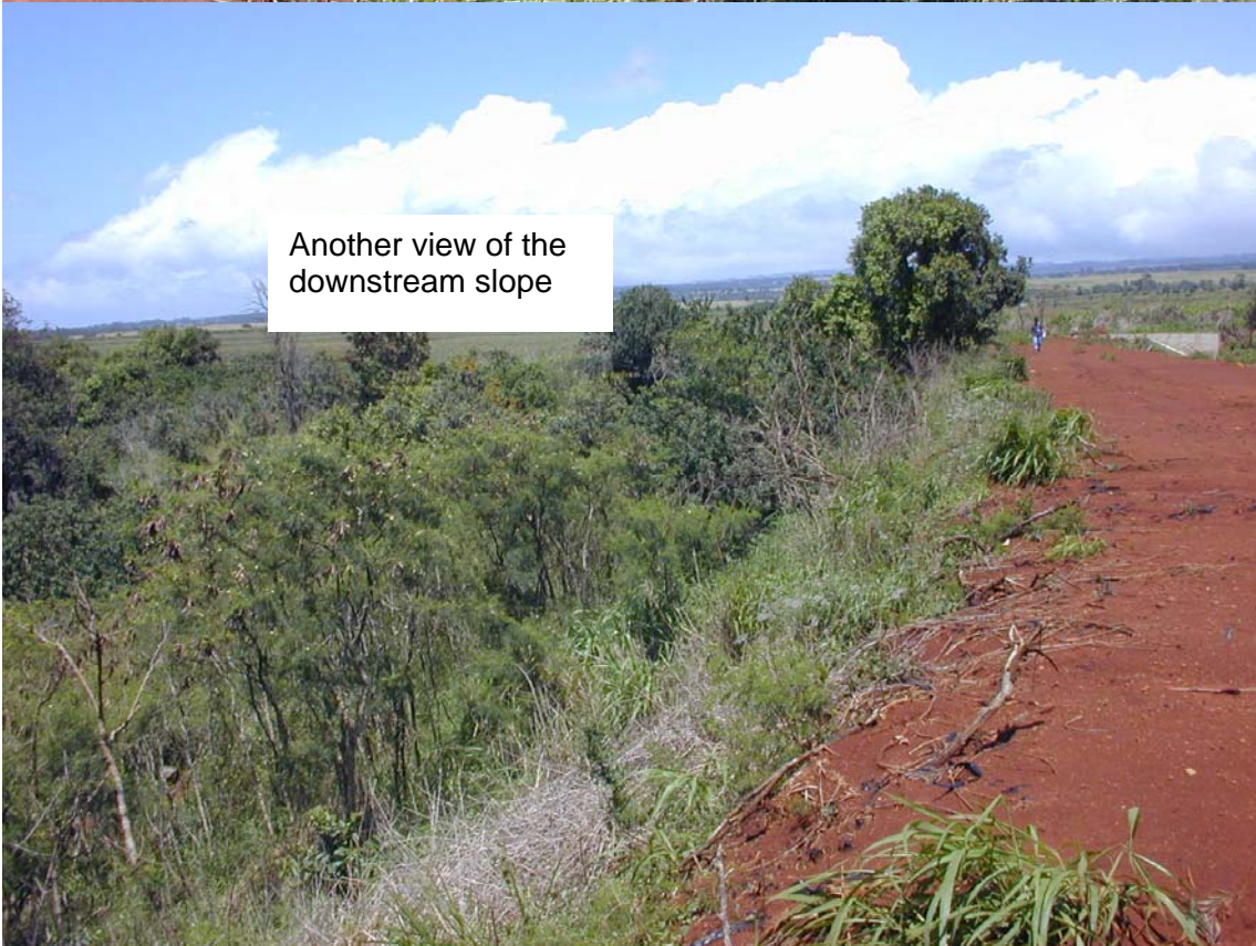
Another view of the downstream slope