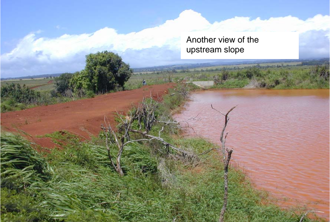
Another view of the upstream slope

Dam ID: HI00045 Name: Helemano 16 Reservoir