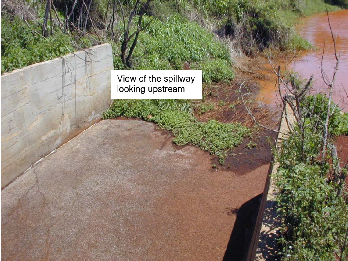
View of the spillway looking upstream