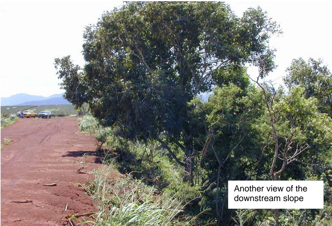
Another view of the downstream slope