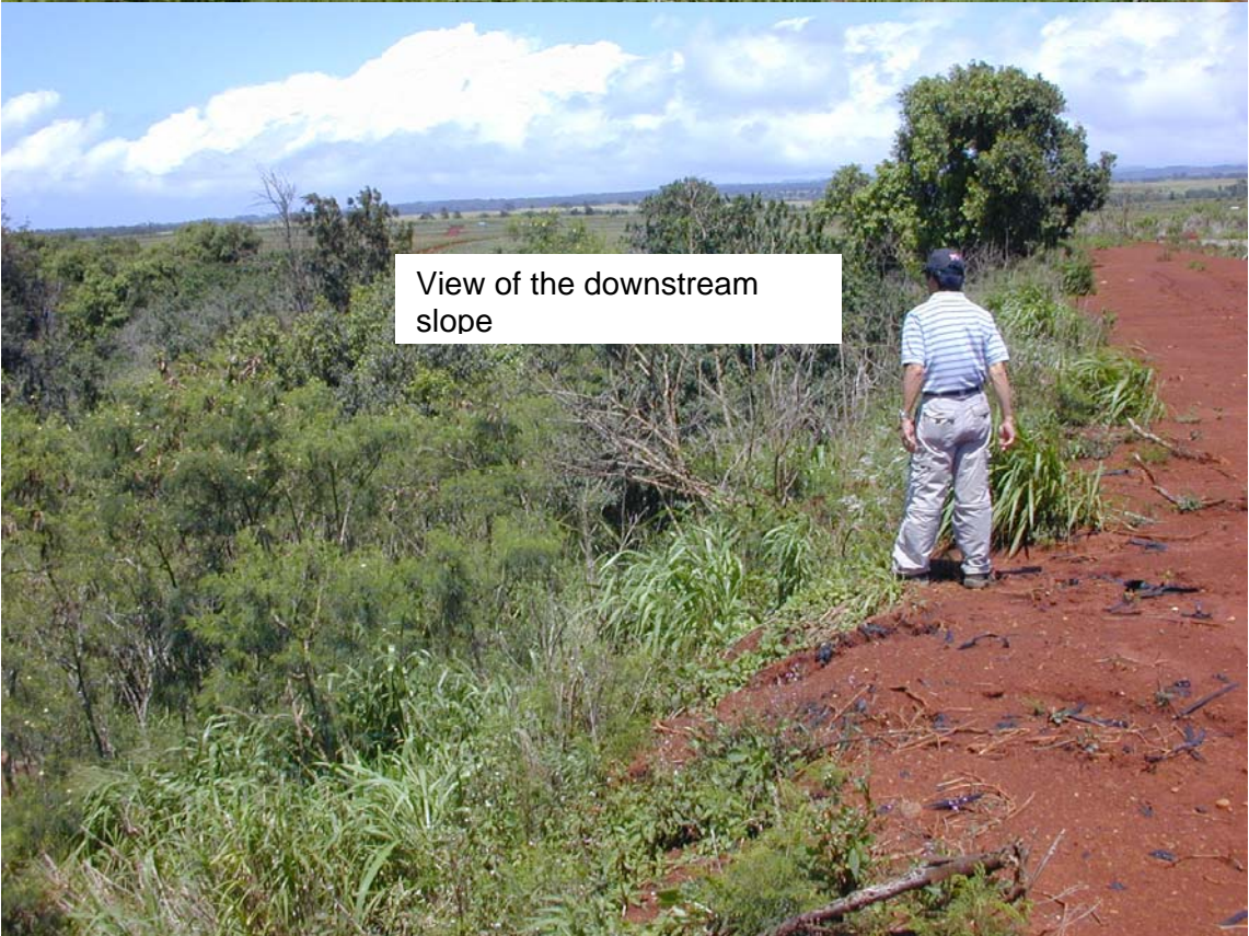
View of the downstream slope