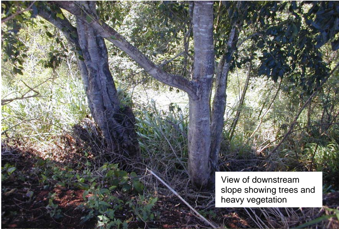
View of downstream slope showing trees and heavy vegetation